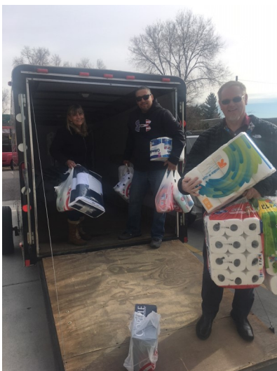
Shelter donations from Zion Lutheran School