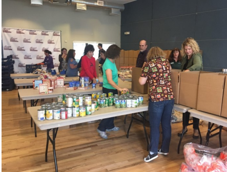
Volunteers pack over 250 Thanksgiving Meal Boxes