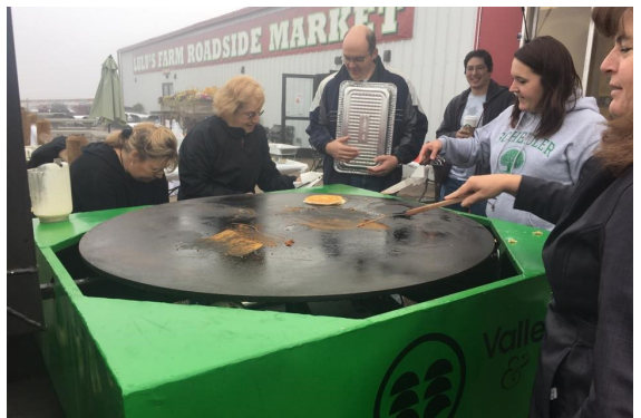
Volunteers at the LuLu's Farm Pancake Fundraiser