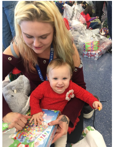
Christmas gifts for our shelter kids, thanks to the United Airlines Santa Fantasy Flight