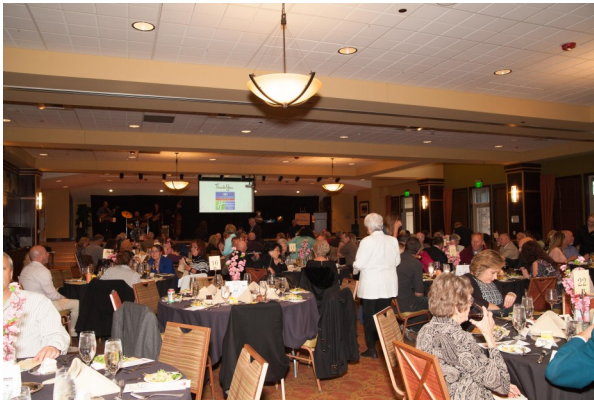
2017 Spring Out of Homelessness Gala