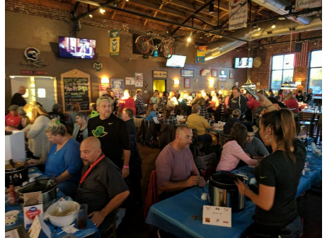
Annual Chili Cook-Off sponsored by the Flutterby Foundation, Ltd.